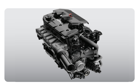
Rotax® 1630 ACE™ - 300 Engine

An innovative, industry-first system that allows you to free your pump of weeds and debris with intuitive handlebar-activated controls.