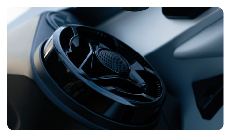
BRP Audio - Premium System

USB port, watercraft cover, storage bin organizer, knee pads, exclusive coloration and more.