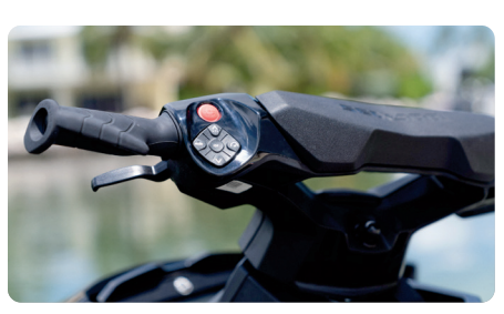
iDF - Intelligent Debris-Free Pump System

The industry's first manufacturer-installed truly waterproof Bluetooth† audio system.